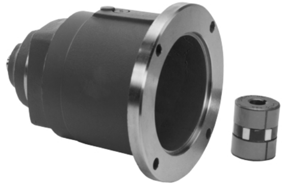
3 Piece Coupled